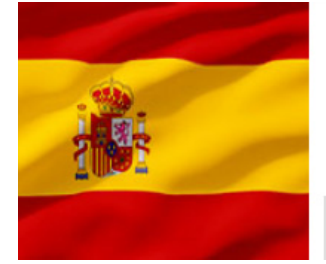
Spain formation £3,019.00 More Information