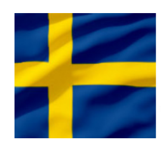
Sweden formation £2,519.00